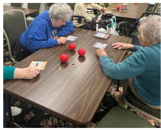
SCGHD's Nursing Division had a blast leading Bingocize at Kiwanis Manor of Tiffin on Feb. 27.